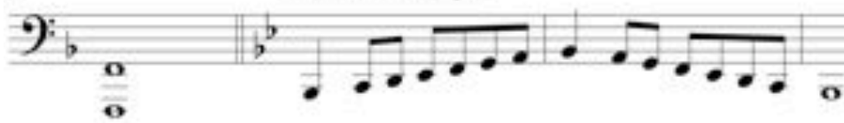
Concert Bb Major